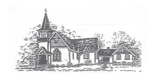
No. 54 Volume 11 November 2015

Bon Air Christian Church (Disciples of Christ) 2071 Buford Road N. Chesterfield, VA 23235 804-272-6228 Fax 804-330-0381 baccdoc@verizon.net http://www.baccdoc.org