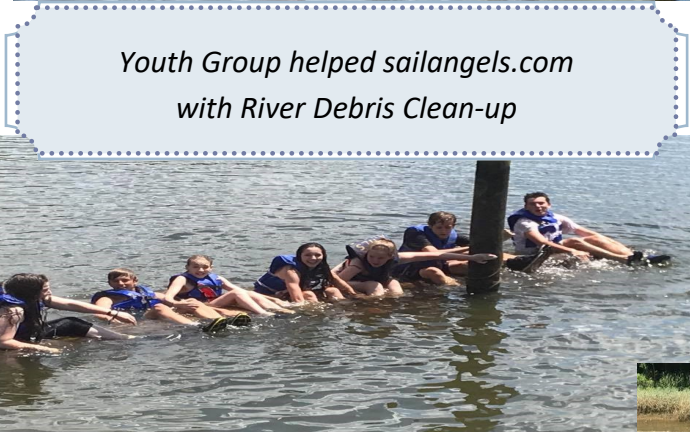
Youth Group helped sailangels.com with River Debris Clean-up