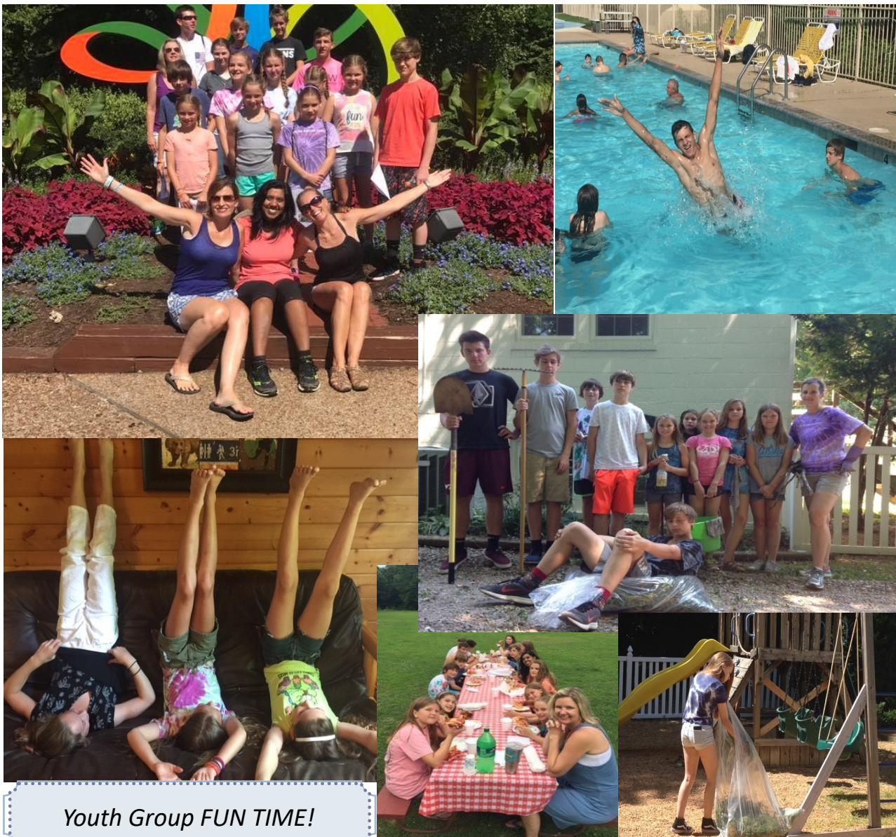
Youth Group FUN TIME!

Finally we say “thank you” to our wonderful youth group. We are grateful for all of their hard work and for the ways they make our church and community better. Your ministry to us is much appreciated. We love our youth group and our youth group leaders!