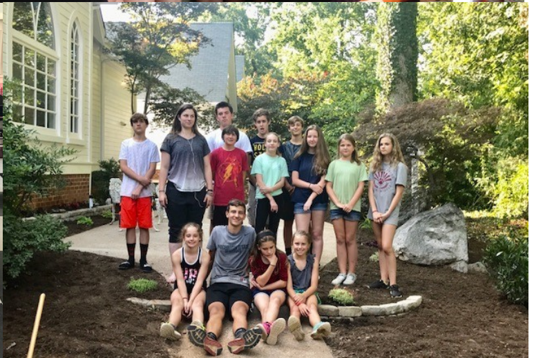
Well done good and faithful servants!