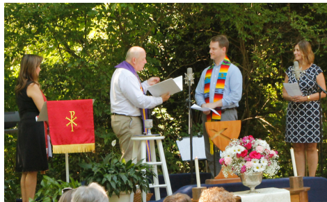
Administering the Covenant