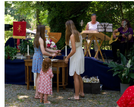
Lighting the Candles