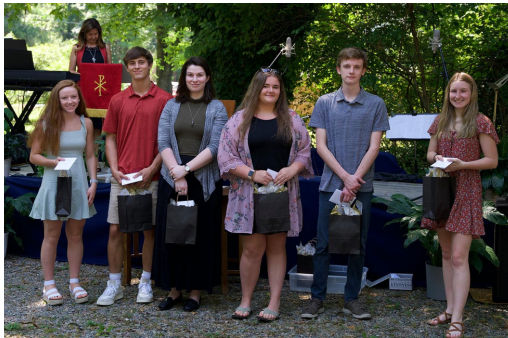
Graduate Recognition 2021