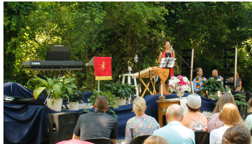
Call to Worship