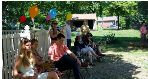
Worship on the Lawn