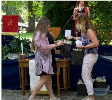
Honoring Our Grads