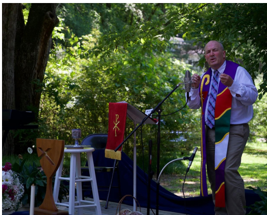
An Awesome Sermon