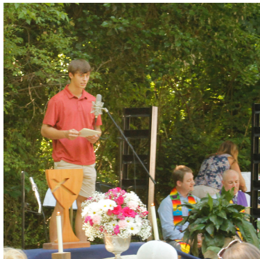
Words of Assurance