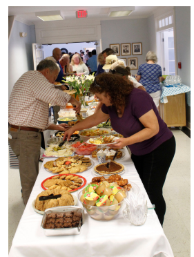
We Believe in Salvation!