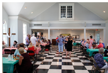
Food and Friends