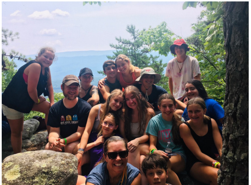
Second Triple campers