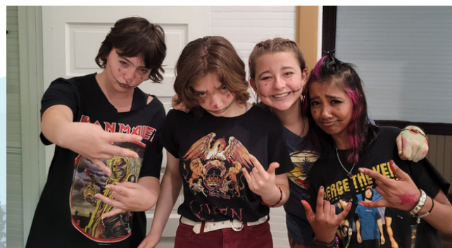
Pics from CAMPDD

Be on the look-out for more pics to come!