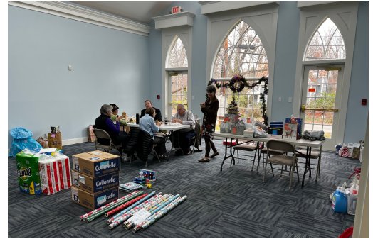
BACC friends work on organizing Christmas gifts donated to help our families