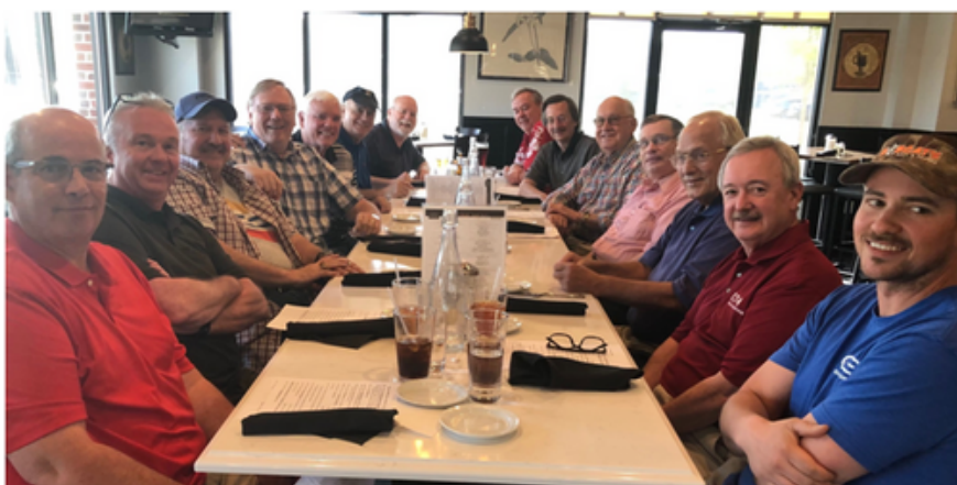
'On April 20th, sixteen men gathered at Four Seasons Restaurant in VA for a hearty meal and lively discussions across the table.