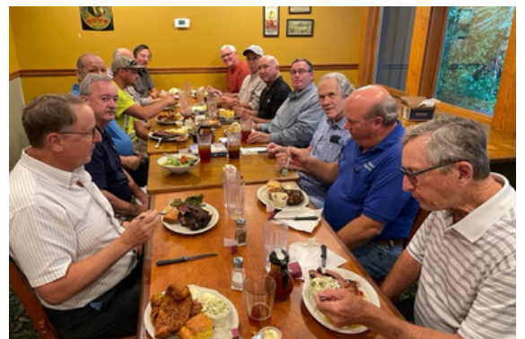
Men's Gathering at Extra Billy's Brewery on 9-21-2023.

The Capital Ale House is celebrating OCTOBERFEST this month, so expect schnitzel and wurst to be offered as specials.