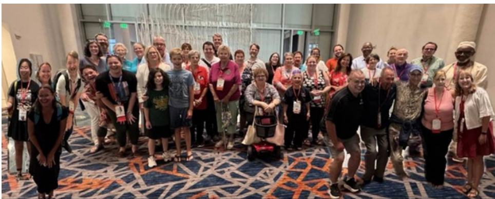
Our Virginia Region Delegation to General Assembly