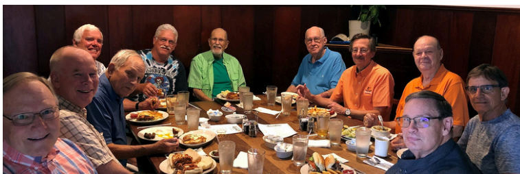
BACC Men enjoying lunch at Joe's Inn Bon Air on Wednesday, July 2nd, 2025.