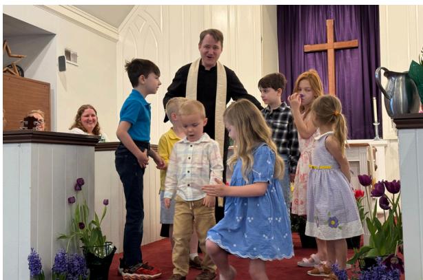
Easter Morning Children's Message