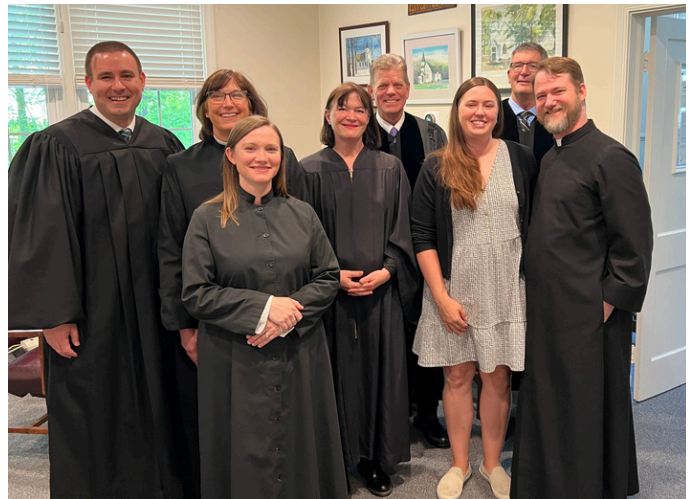
Bon Air Ministers for our Ecumenical Good Friday worship