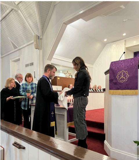
Maundy Thursday hand washing

Thank you to everyone who helped make our Holy Week so special here at BACC! Maundy Thursday, Good Friday, Holy Saturday, Easter Sunday, Baptisms, and an Egg Hunt – Blessing abound! Alleluia, Alleluia!