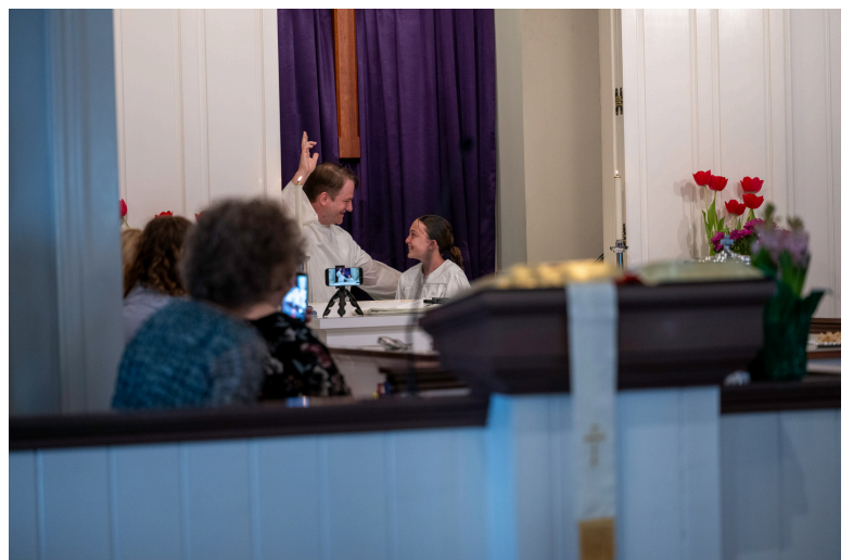
Easter Morning Baptisms

"He is not here, for he has risen, as he said. Come, see the place where he lay." Matthew 28:6