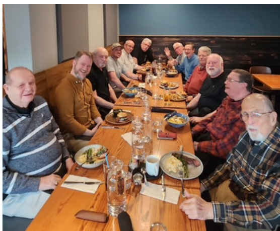
Men's March Dinner at Charred